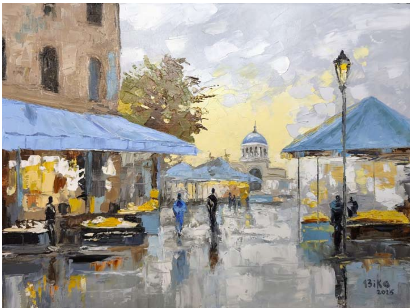
↑ City of Twilight, oil on canvas, 30x40cm, 2025