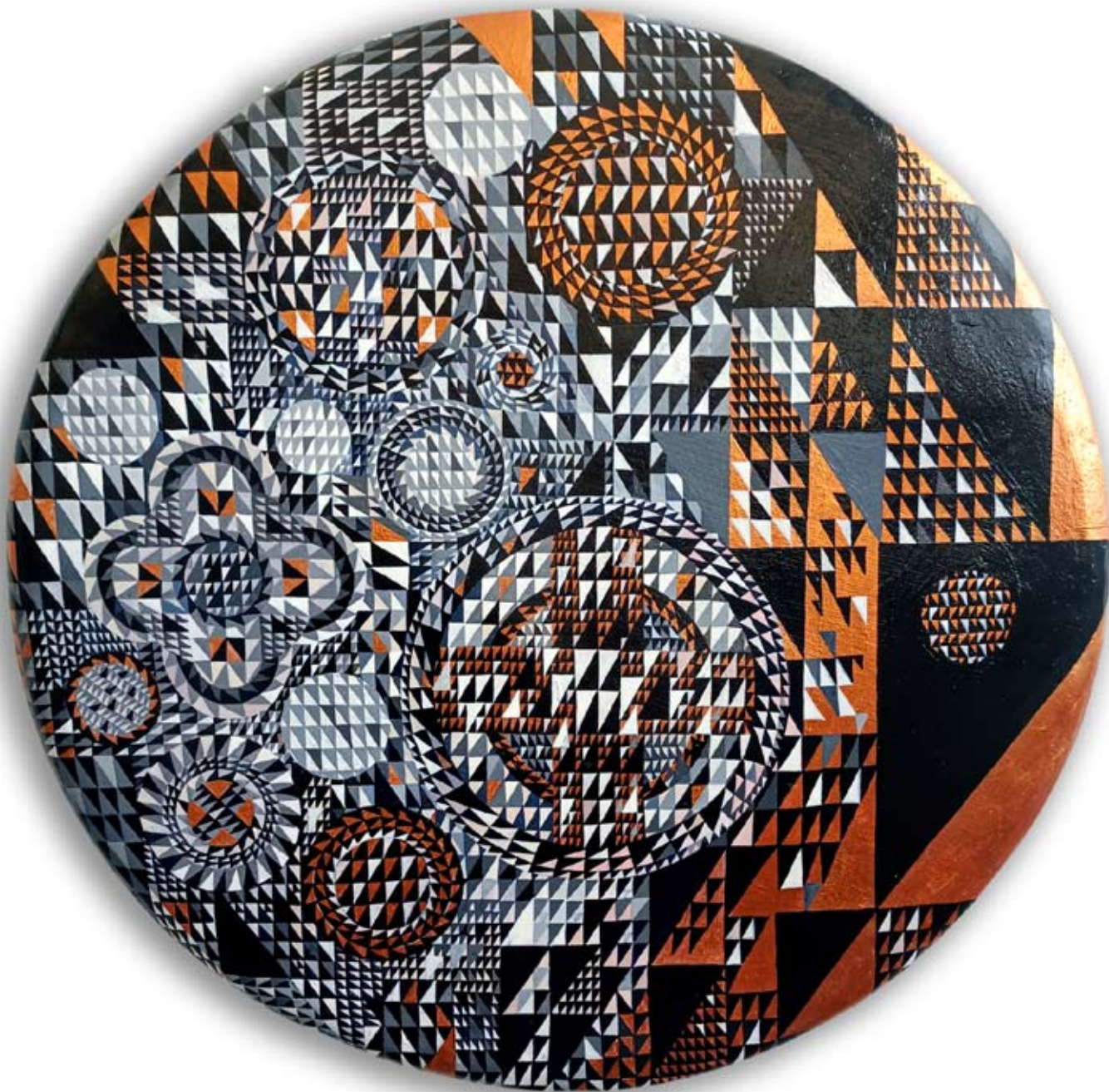
← Golden Wave, wall sculpture, mixed media, acrylic painting, 22x26cm, 2025