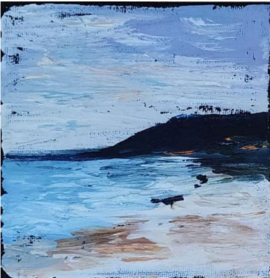
Trio (triptych), oil on canvas, 15x15cm, 2025