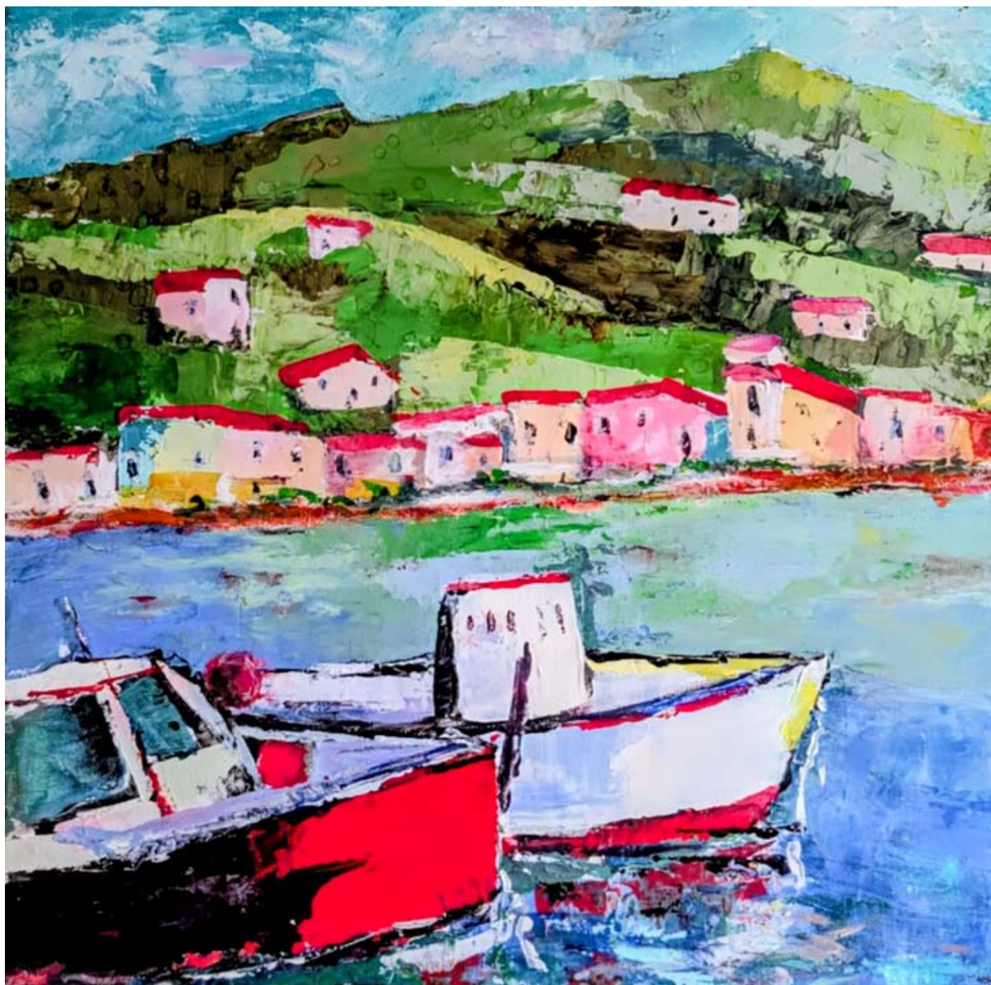
↑ Boats, acrylic on canvas, 40x40cm, 2025