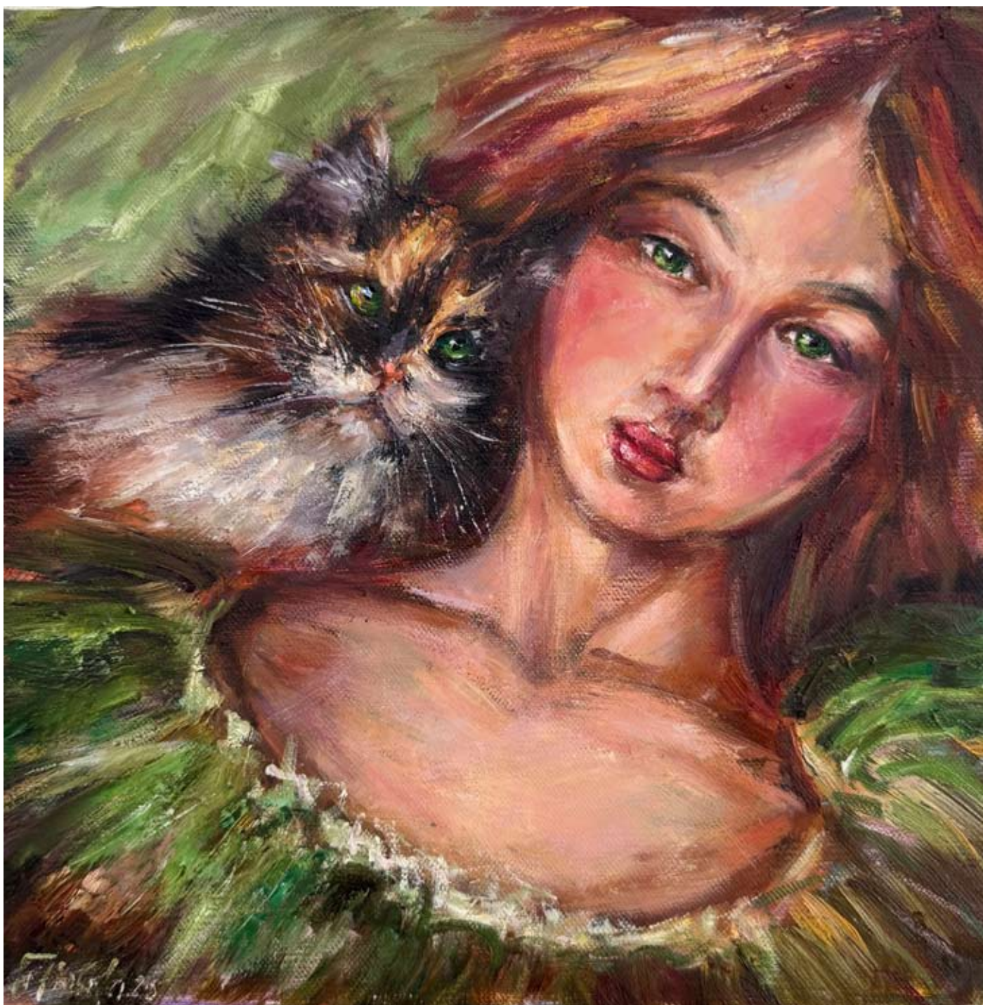
↑ Green-eyed, oil on canvas, 30x30cm, 2025