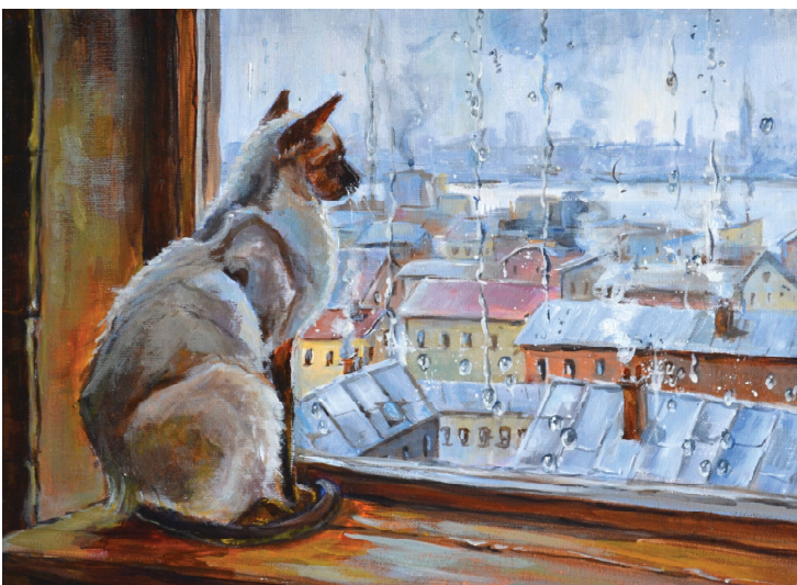
A Window In The Rain , acrylic on canvas, 30x40cm, 2026, price: €300

This painting shows a sleeping ginger cat in a sunlit meadow. Loose, expressive brushwork gives the fur vivid texture, while the soft landscape behind it opens into a calm view of trees, sky, and summer light. The contrast between the cat's body and the wide field creates a sense of intimacy within openness. More than a simple animal portrait, the work conveys trust, stillness, and belonging in nature.