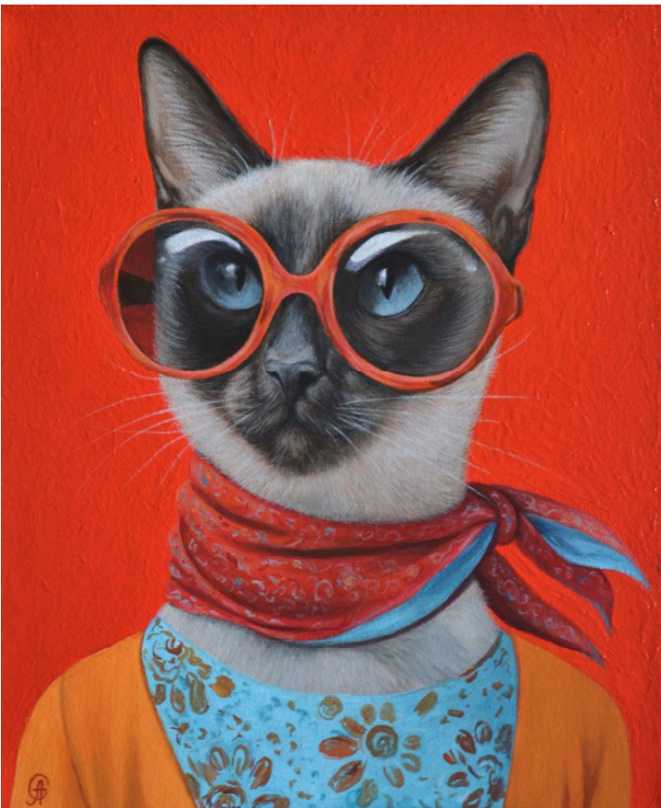
Thomas acrylic on canvas, 30x25cm, 2025 price: €400

Set against a bold red background, this cat portrait combines fashion, humor, and attitude. Oversized sunglasses, a patterned scarf, and a bright palette turn the animal into a self-possessed character with unmistakable retro flair. The painting plays with the language of portraiture, replacing human vanity with feline poise and charm. Both decorative and witty, the work captures the pleasure of style as performance.