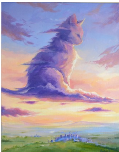
Above the Rooftops , acrylic on canvas, 40x30cm, 2026, price: €250

This painting imagines a cat as a monumental cloud-form suspended above a distant landscape, shifting the scale of reality into something dreamlike and tender. Built from soft lavender, blue, and peach tones, the figure seems to dissolve into the sky while still holding the calm presence of a living creature. The small city below emphasizes the cat's vastness, turning it into a quiet guardian, vision, or passing thought. Rather than depicting a literal scene, the work reflects on wonder, altered perspective, and the emotional power of imagining the familiar at an impossible scale.