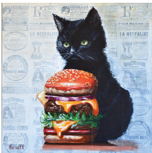
Summer in the Cat Dimension , acrylic on canvas, 50x50cm, 2026, price: €500

This painting combines animal portraiture with playful pop-inflected still life. A black cat with luminous green eyes sits behind an oversized cheeseburger, turning an ordinary food item into a theatrical centerpiece. The contrast between the cat's calm, watchful presence and the exaggerated richness of the burger adds wit and character, while the vintage-style printed background reinforces the work's nostalgic, graphic atmosphere. Rather than presenting a simple humorous scene, the painting explores appetite, temptation, and personality through a deliberately stylized composition.