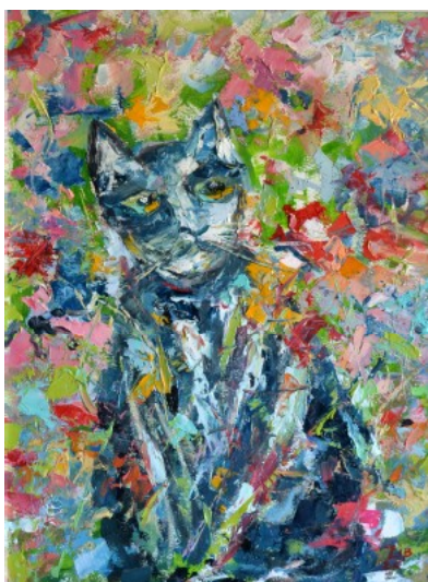
Cat Dali , oil on panel, 41x31cm, 2026, price: €250

Preferred medium: oil painting in an impressionist style