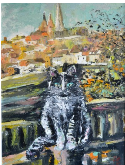
Old Town , oil on panel, 41x31cm, 2026, price: €250

This painting places a cat within a dense field of color, where figure and background seem to emerge from the same restless painterly energy. Quick, layered brushstrokes in blue, pink, green, yellow, and red dissolve the boundary between portrait and surrounding space, making the animal feel both present and elusive. The cat's watchful eyes hold the composition together, offering a point of calm within the visual intensity. Rather than functioning as a conventional animal portrait, the work becomes a study of mood, perception, and painterly transformation.