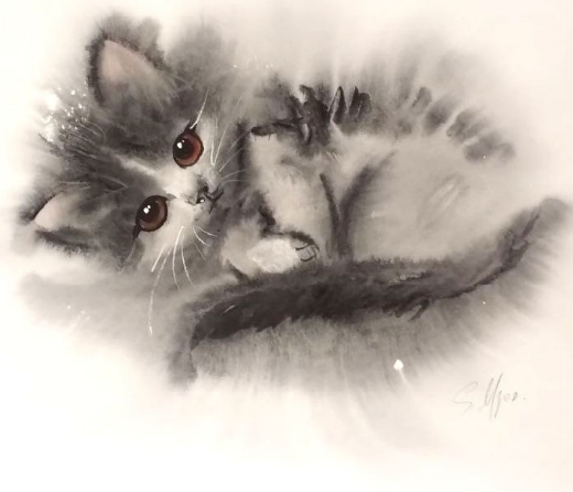
Little Wonder watercolor on paper, 35x47cm, 2026 price: €150

Cloud Cat presents a curled feline form with remarkable economy and softness. Built from fluid gray washes and delicate linear accents, the image hovers between portrait and apparition, as if the animal were emerging from mist. The restrained palette and open white ground give the work a meditative stillness, while the cat's alert eyes and fine whiskers preserve a quiet sense of presence. Rather than focusing on detail, the painting captures an essence: warmth, fragility, and the suspended intimacy of a creature at rest.