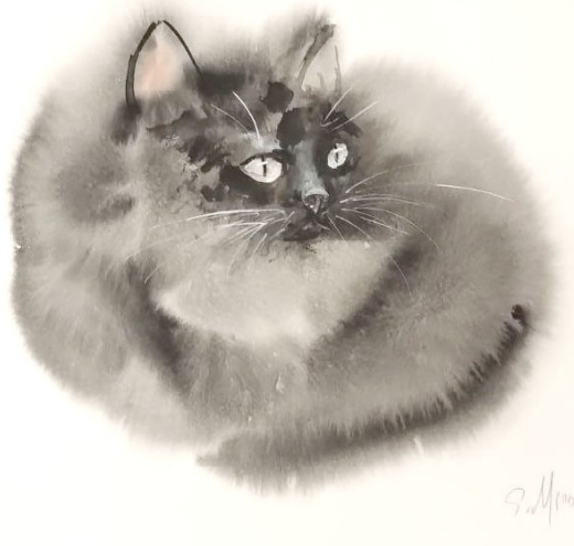
Cloud Cat, watercolor on paper, 35x47cm, 2026 price: €150

Cloud Cat presents a curled feline form with remarkable economy and softness. Built from fluid gray washes and delicate linear accents, the image hovers between portrait and apparition, as if the animal were emerging from mist. The restrained palette and open white ground give the work a meditative stillness, while the cat's alert eyes and fine whiskers preserve a quiet sense of presence. Rather than focusing on detail, the painting captures an essence: warmth, fragility, and the suspended intimacy of a creature at rest.