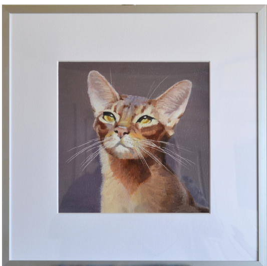
Abyssinian cat , oil on cpanel, 33x33cm, 2024, price: €180

Preferred medium: oil painting in a realistic manner