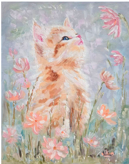
Curiosity , acrylic on canvas, 50x40cm, 2026, price: €500

Preferred medium: impressionism with elements of expressionism