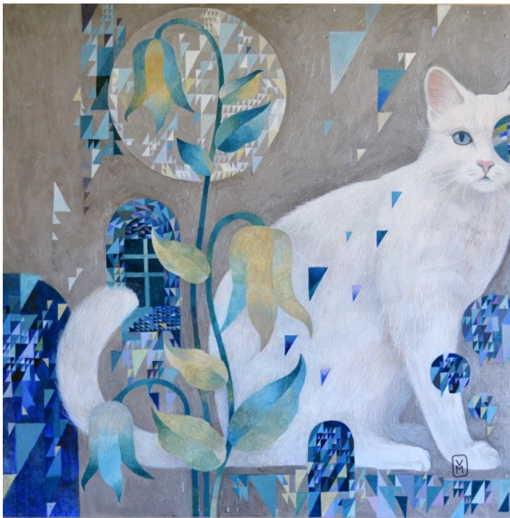
Red Cat's Dreams, acrylic on panel, 60x60cm, 2026 price: €600

This painting places a white cat within a quiet symbolic world of blue geometric fragments, bell-shaped flowers, and window-like forms. The animal's pale body is rendered with softness and precision, while the surrounding pattern introduces a crystalline, dreamlike order. Cool blues and silvery neutrals give the composition a restrained, luminous atmosphere, balancing stillness with subtle tension. Rather than functioning as a simple animal portrait, the work presents the cat as a presence moving through a space of reflection, silence, and imagined architecture.