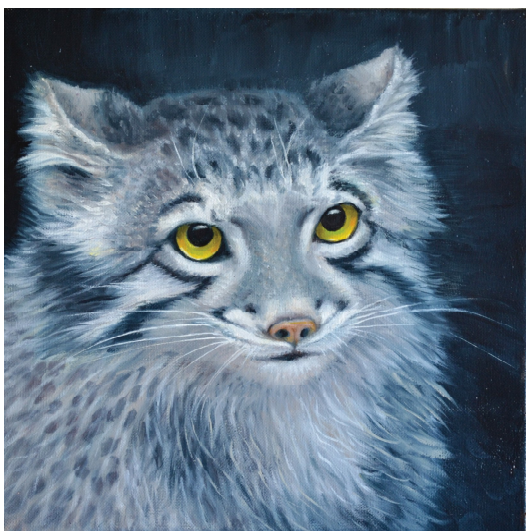
Pallas's Cat (Still a Cat) , oil on canvas, 30x30cm, 2026, price: €200

This portrait focuses on the quiet intensity of an Abyssinian cat, rendered with close attention to expression, posture, and light. Warm brown and cream tones give the animal a soft sculptural presence, while the large ears and upward gaze create a sense of alert intelligence. Set against a muted background, the composition remains spare and concentrated, allowing personality to emerge through subtle shifts of color and form. Rather than functioning as a simple pet portrait, the work captures dignity, curiosity, and self-possession.