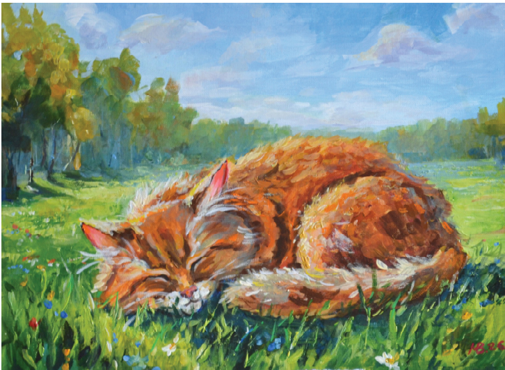
A Field of Dreams , acrylic on canvas, 30x40cm, 2026, price: €300

Preferred medium: oil and acrylic painting