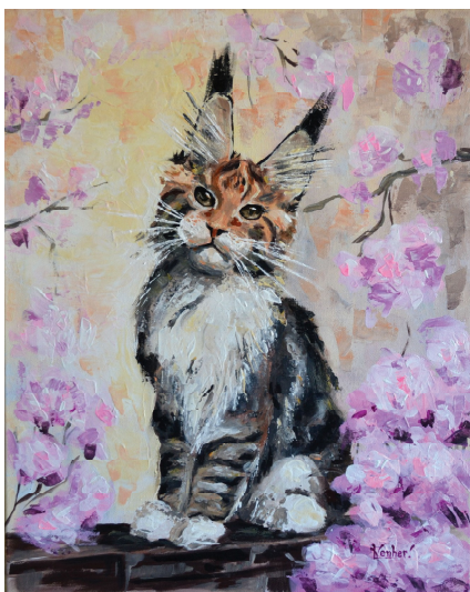
Marquis of the Rose Garden , acrylic on canvas, 50x40cm, 2026, price: €500

This painting presents a young cat in a field of soft pink flowers, transforming a simple animal portrait into an image of tenderness and quiet wonder. The kitten's upward gaze suggests curiosity and first discovery, while the light pastel palette gives the scene an airy, almost dreamlike atmosphere. Loose, delicate brushwork softens both fur and petals, allowing the figure to blend gently into its floral surroundings. The work captures a fleeting mood of innocence, spring, and calm attention.