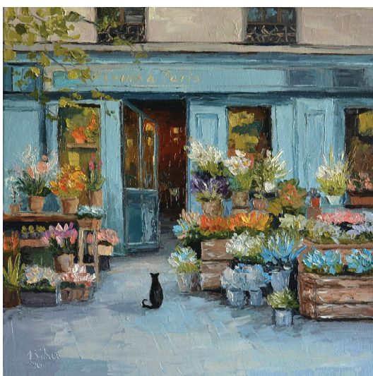
Floral Boutique , oil on canvas, 35x35cm, 2026, price: €300

This painting places a solitary cat before a night water view, turning an urban landscape into a moment of quiet contemplation. The animal is seen from behind, facing a lit bridge and its shimmering reflections, while a cloud-like cluster of pale blue marks hovers above like a moonlit thought or passing dream. Thick, broken brushwork gives the city and water a flickering, atmospheric presence. Rather than treating the cat as a simple anecdotal figure, the work suggests a shared stillness between observer and city—an image of solitude, attention, and nocturnal wonder.